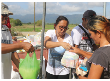
Distributing the food

The MSC Mission Office in the Philippines have been working in rapid response with the MSC Centre for the Poor to issue essential emergency aid to several communities that have been critically affected by severe flooding in the Mindanao region.