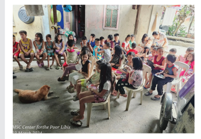
Children in Libis Baesa Elementary School

MSC Philippines shared these facebook photos from the programme, noting “Observe the joy on the faces of the children currently benefiting from the feeding program in Libis Baesa.”