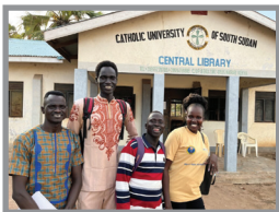
Student teachers start placement

Schools are always busy in South Sudan in February. The academic year here runs differently from Ireland and England, with our long holidays based around Christmas. So the back to school trials and tribulations begin in February. Students have to register for their studies, including paying their fees. Like home when parents have a number of children, this can be a substantial amount of money. Usually, the Catholic schools charge the equivalent of two bags of charcoal or just one chicken for the entire year. The underlying ethos is education is for everyone, but everyone should contribute something, insofar as they can. For Loreto, the fee includes a daily meal, their school books, treatment in our clinic (malaria is still around, and never, ever underestimate the number of plasters needed on any day as 1,300 children can get into a lot of mischief), and of course their studies.