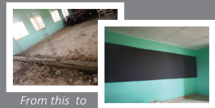
From this to

In our 2023 World Projects Appeal, the Sisters asked for help in funding the development of classrooms at their school in Ouagadougou, the capital city of Burkina Faso, West Africa. Burkina Faso is one of the poorest countries in the world, and the Sisters in Ouagadougou have been working in the region since 2007 to help young children who would otherwise have no prospects of education and advancement. The demand for places at the school is overwhelming, and the Sisters strive to accommodate as many children as possible, which has led to severe issues with overcrowding in recent years.