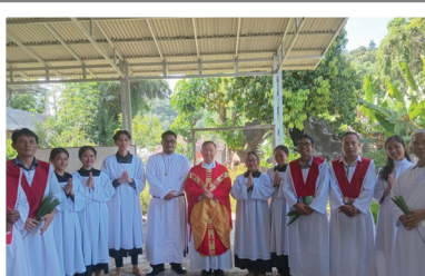
MSCs celebrating Easter in Indonesia