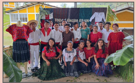
Showcasing traditional clothing.