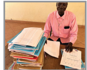
Student teacher correcting homework