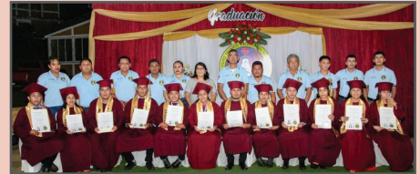
2023 Business Administration Graduates of Centro Faustino Villanueva

In 2024 we celebrate 40 years of service, this very special anniversary year is already off to a flying start! We look forward to seeing more great things from the staff and students and, as ever, we keep the community there in our prayers as they continue in their remarkable efforts to create new opportunities for employment and empowerment for young people in need.