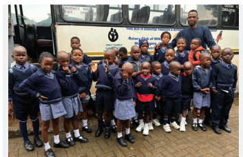
Children arriving back to Holy Family centre from local School.