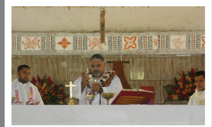
MSC Formation community, Holy Spirit Parish, Fiji.

Strengthened by the Easter hope that radiates its redeeming light over us all, from the Western Road in Cork to Mozambique, Fiji, Indonesia, the Philippines, and everywhere in between, we welcome and embrace the brighter days ahead, with every grace and blessing of the Sacred Heart to our mission friends everywhere, you were in our prayers this Easter season and throughout the year ahead.