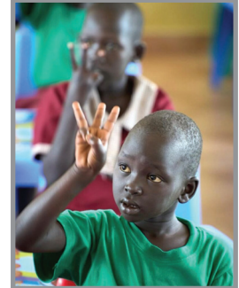
Primary school class

It's wonderful to see. Over the course of the next twelve weeks, he and his classmates will experience what teaching in secondary schools is really like. It will be a steep learning curve for them, as a classroom filled with fifty teenagers in the throes of teenage trials and tribulations as they can be a tough crowd to please. Increasingly though, the youth are seeing the value in education and the depth of their commitment is impressive. When our students graduate, they will be among the first trained teachers who have qualified from the Catholic University in Rumbek. It is a sign hopefully of things to come.