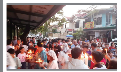
MSC Easter Celebrations Caloocan, Philippines.